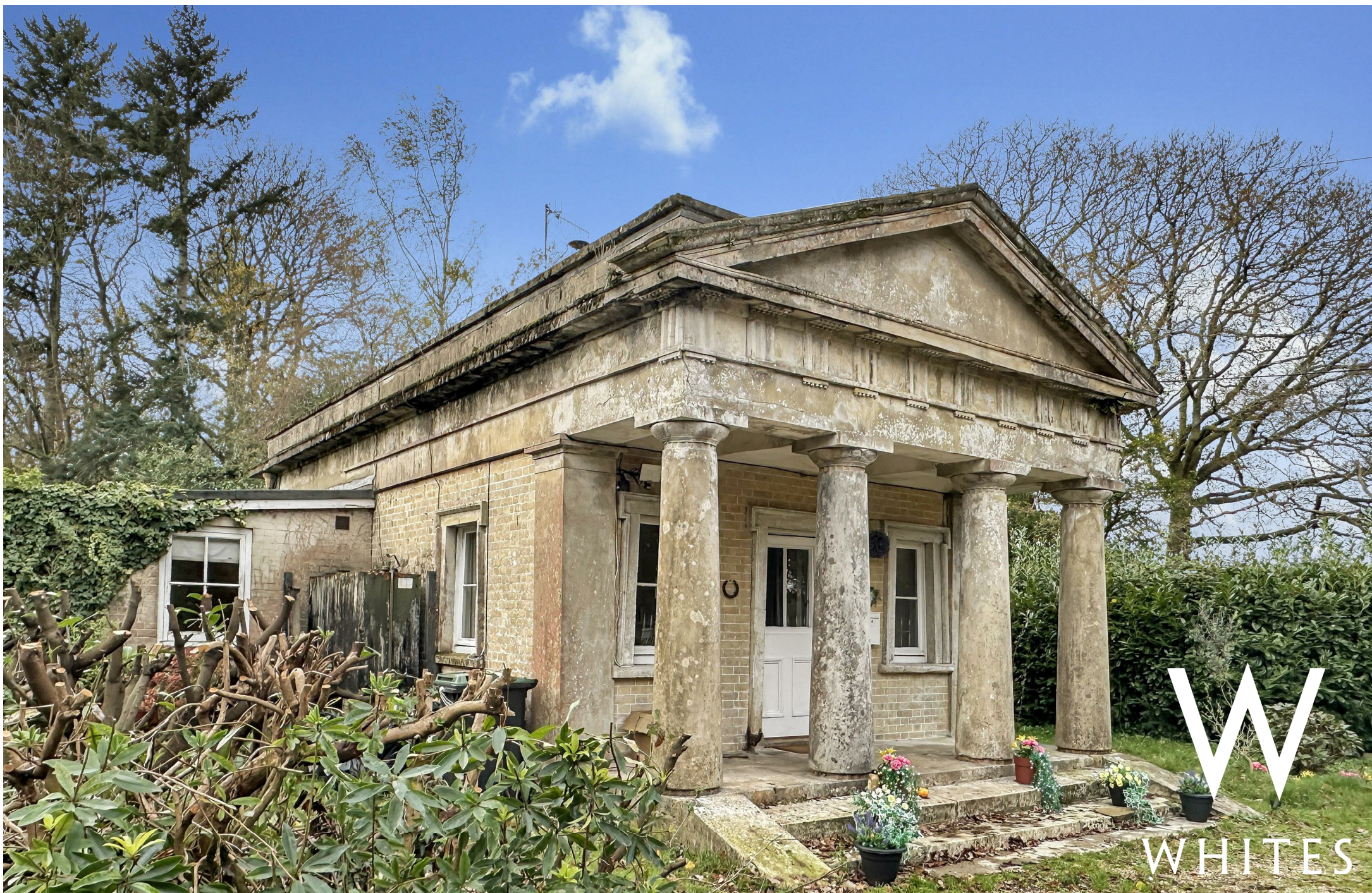
Hatchett Lodge Hatchett Green, Hale, Fordingbridge, SP6 2ND